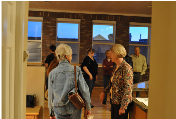
Participants in the loft tours, March 2011.

In May, the Commission celebrated Historic Preservation Month with a reception at the National Board of Chiropractic Examiners Building with 68 people in attendance. World War II and the POW Camp 202 were the theme for the reception, with presentations to property owners and award winners, and presentations about the POW Camp and about World War II.