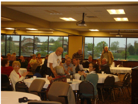
World War II Veterans being honored at Historic Preservation Month Reception

In May, the Commission celebrated Historic Preservation Month with a reception at the National Board of Chiropractic Examiners Building with 68 people in attendance. World War II and the POW Camp 202 were the theme for the reception, with presentations to property owners and award winners, and presentations about the POW Camp and about World War II.