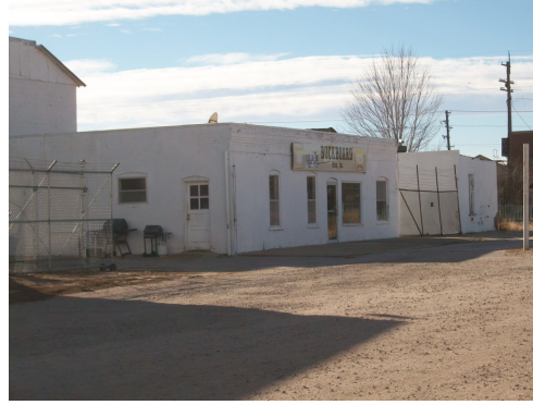
2. Sunrise Tour: 608 9 th Street