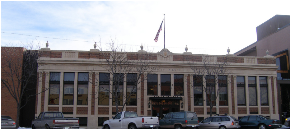
Greeley History Museum, Historic Greeley Tribune Building, 714 8 th Street. Site of Lunch 'n Learn series and Researching Historic Property Workshop

The Commission and staff hosted several more new events in 2011. The Historic Preservation Staff worked with Museum Staff to host a workshop on Researching Your Historic Property in February 2011, which eleven people attended and which included a hands-on research component.