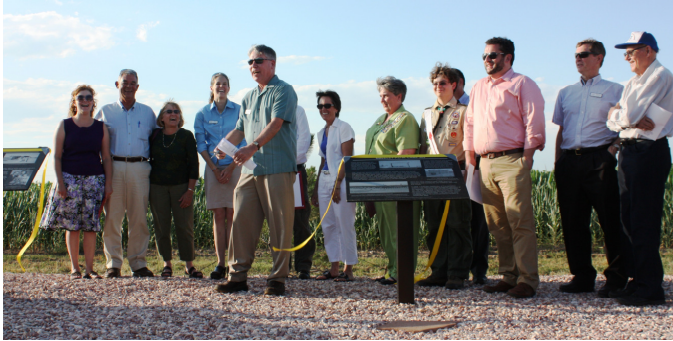
Ribbon cutting, July 25, 2011.

History Colorado Certified Local Government grant. Approximately 50 people attended the ribbon cutting ceremony, and Colorado Preservation, Inc. awarded participating organizations with certificates indicating the pillars were a "SAVE" on the Endangered Places List, including to the Colorado Department of Transportation, the City of Greeley, Historic Greeley, Inc., Boy Scouts of America, and the Daughters of the American Revolution.