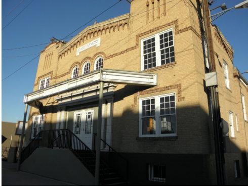
1. Downtown Tour: Armory, 614 8 th Avenue