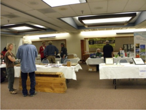
Attendees and vendors at Dust to Dazzle, May 16, 2015 at the Greeley Recreation Center in Downtown Greeley.

The Commission also presented plaques to Greeley Historic Register property owners and Historic Preservation Month Awards.