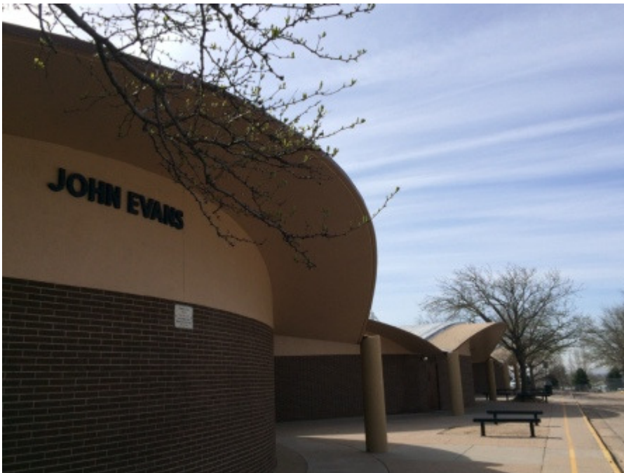
The school was torn down in October 2015.