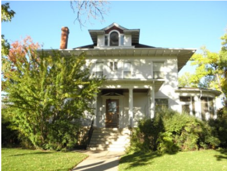
Southard-Gillespie House, 1103 9 th Avenue