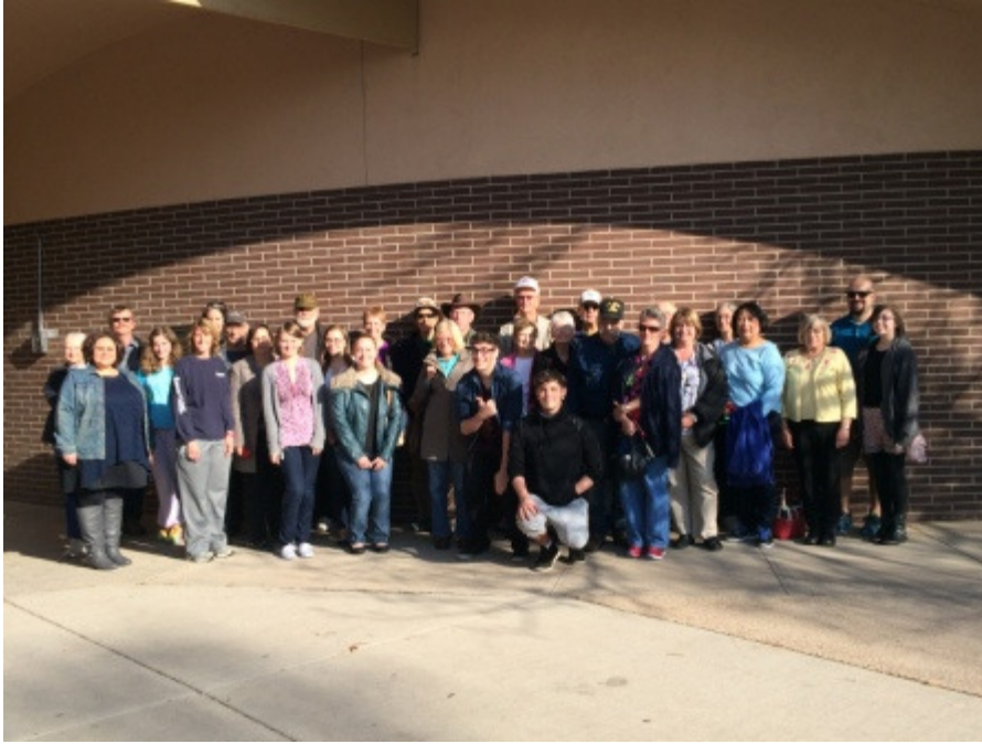
A large group came to take a tour of one of Greeley's round schools, the John Evans Middle School, in April 2015.