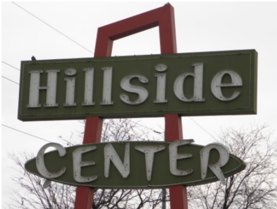
Hillside Center Sign, 2525 11 th Avenue

During 2015, the Commission designated the Hillside Center Sign at 2525 11 th Avenue and the Southard Gillespie House at 1103 9 th Avenue on the Register for historical, architectural, and geographical significance.