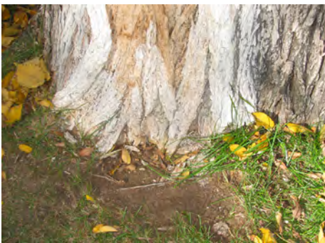
Figure 4. Base of tree where wetwood slime has killed the grass.