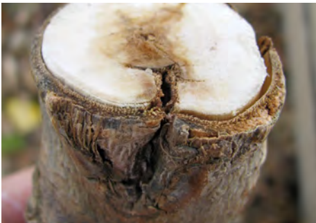
Figure 5. Wet wood induced canker on a nursery grown cottonwood. (W. R. Jacobi).

in the cambium and kills the cambium causing cankers. The xylem is discolored between the central core of wet wood and the cambium so it is assumed these disease symptoms are related to the same cause.