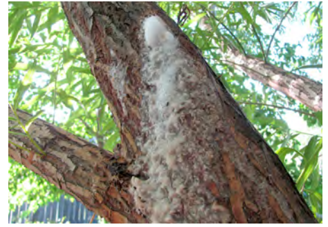
Figure 9. Globe willow with alcohol flux. (W.R. Jacobi).

Several insects commonly visit the oozing slime or alcohol flux and feed on it. Various flies and sap beetles often are seen on the slime. Larval stages of these Insects may develop within the wounded area. Among the most striking Insects that visit oozing slime are bumble flower beetles, a hairy species of June beetle that sometimes clusters in large numbers. None of the insects that visit slime flux wounds are known to transmit the bacteria and there is no need to control them. Alcohol flux attracts wasps and bees which can be a nuisance to people allergic to wasp/bee stings.