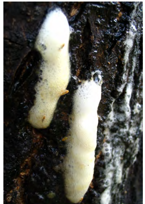
Figure 8. Milky froth of alcohol flux.