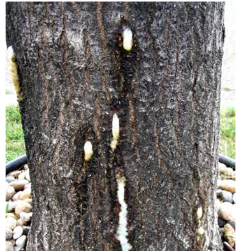
Figure 7. White ash with milky alcohol flux. (J. Walla).