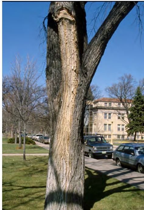
Figure 1. Discoloration of bark of American elm affected with wetwood.

Symptoms of wetwood disorder include a yellow-brown discoloration of the wood, generally confined to the central core of the tree. This affected wood is wetter than surrounding wood and is under high internal gas pressure. The buildup of gas pressure is a by-product of bacterial activity. In elms, the gas consists mainly of methane and nitrogen. The highest gas pressure occurs in elms from May through August. The gas pressure and high moisture content cause an oozing or bleeding of slime, from pruning cuts, through bark cracks and branch crotches. The ooze is foul-smelling, slimy, and colonized by yeast organisms when exposed to air. When the slime dries, it leaves a light gray to white crust