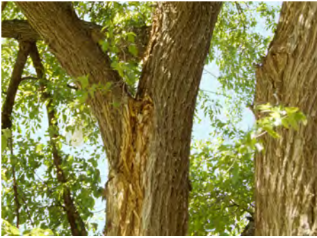
Figure 2. Wetwood discoloration at branch crotch on American elm. (W.R. Jacobi).