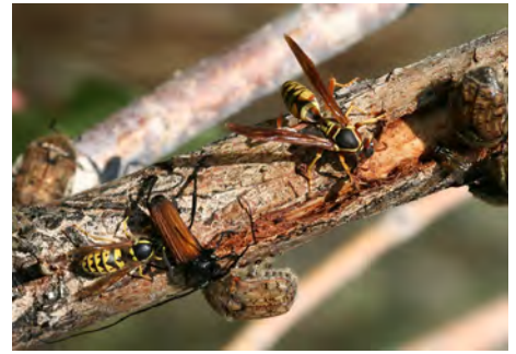
Figure 6. Wetwood or alcohol flux slime with visiting wasps and bumble flower beetles. (W. Cranshaw).

Recently transplanted trees may ooze slime or have alcohol flux if roots are not established and cannot supply adequate water. Fertilizing wetwood-infected trees is only recommended if the tree shows nutrient deficiencies.