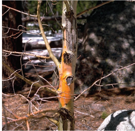
Figure 1: Orange discoloration found in spring and early summer associated with Cytospora canker.

Cytospora species cause branch dieback and cankers on trees or shrubs. Cankers on stems and branches are often elongate, slightly sunken, discolored areas in the bark. Many times, however, the discoloration is not evident because the fungus killed the bark rapidly. The fungus grows so fast on