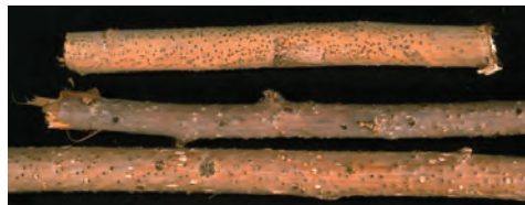
Figure 2: Cytospora canker on three branches, each with scattered pycnidia.