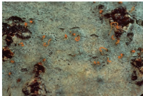
Figure 3: Orange spores oozing from pycnidia.